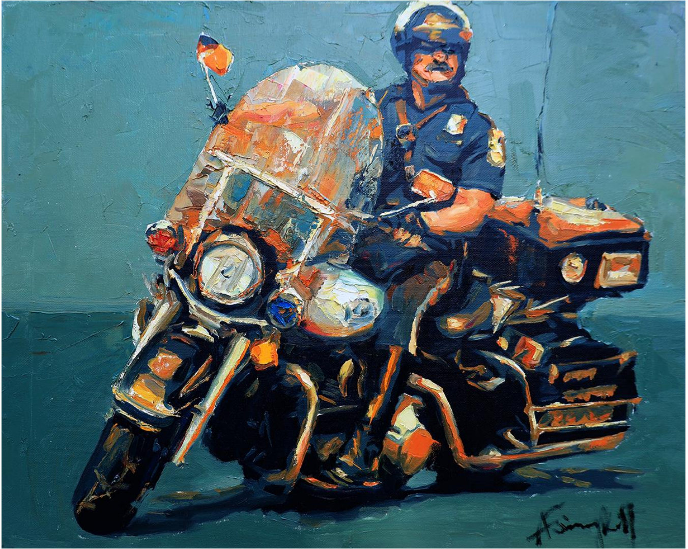
Motor Cop #6 oil on canvas 16x20 in $400