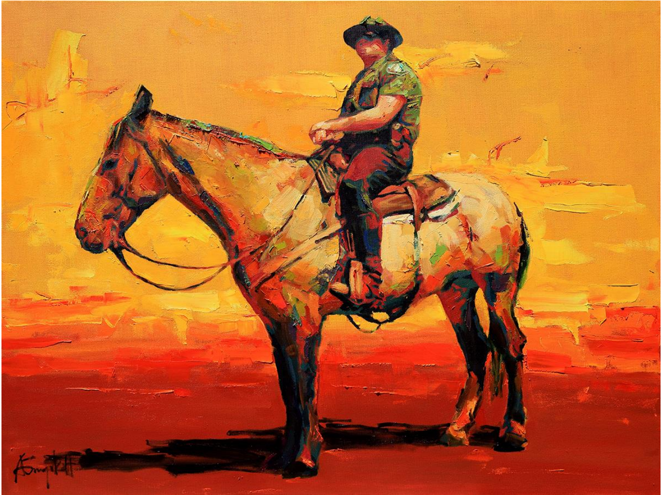
Equine Force oil on canvas 30x40 in $1800