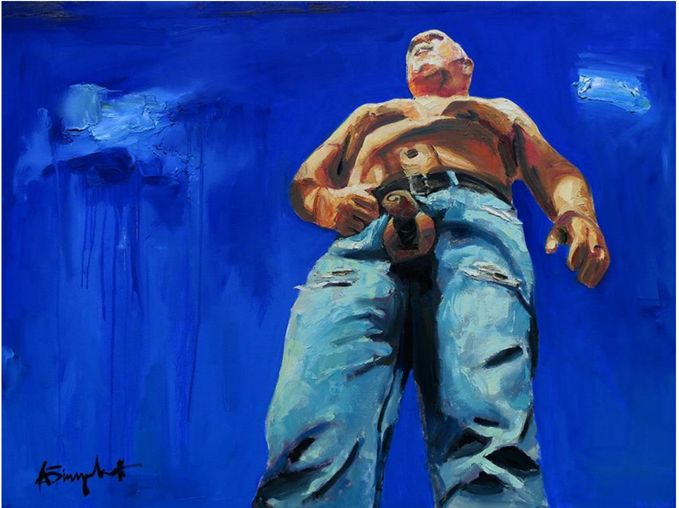
Spanish View oil on canvas 30x40 in $1400