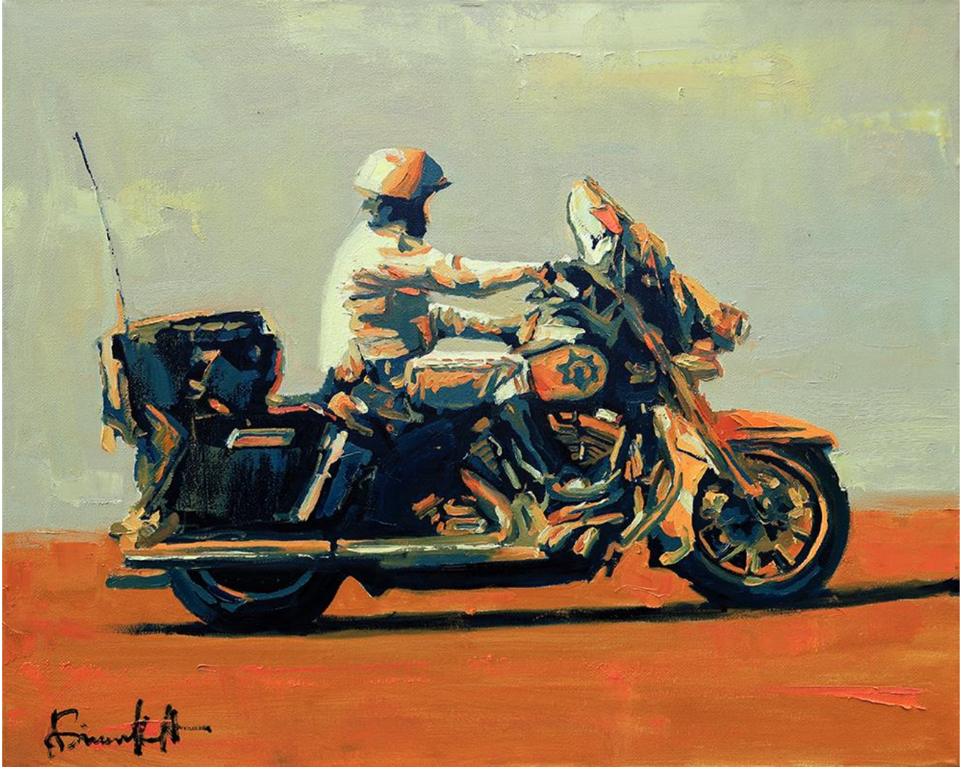
Motor Cop #4 oil on canvas 16x20 in $400