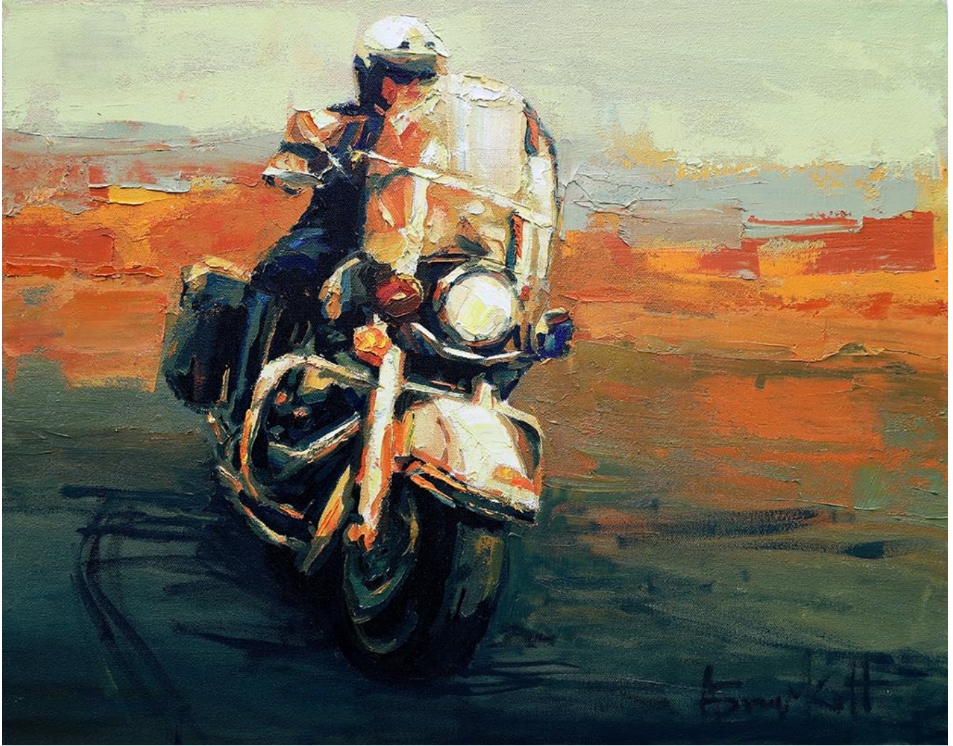
Motor Cop #3 oil on canvas 16x20 in $400