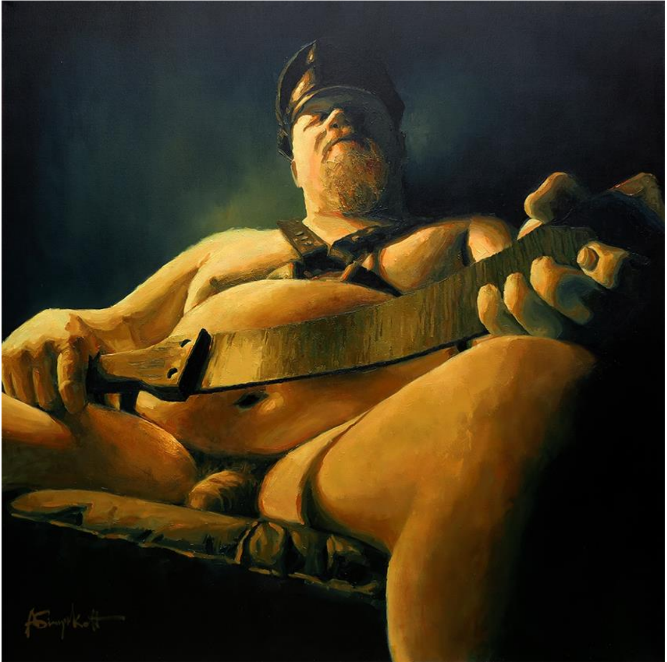
Confess Your Crimes oil on canvas 48x48 in $3200