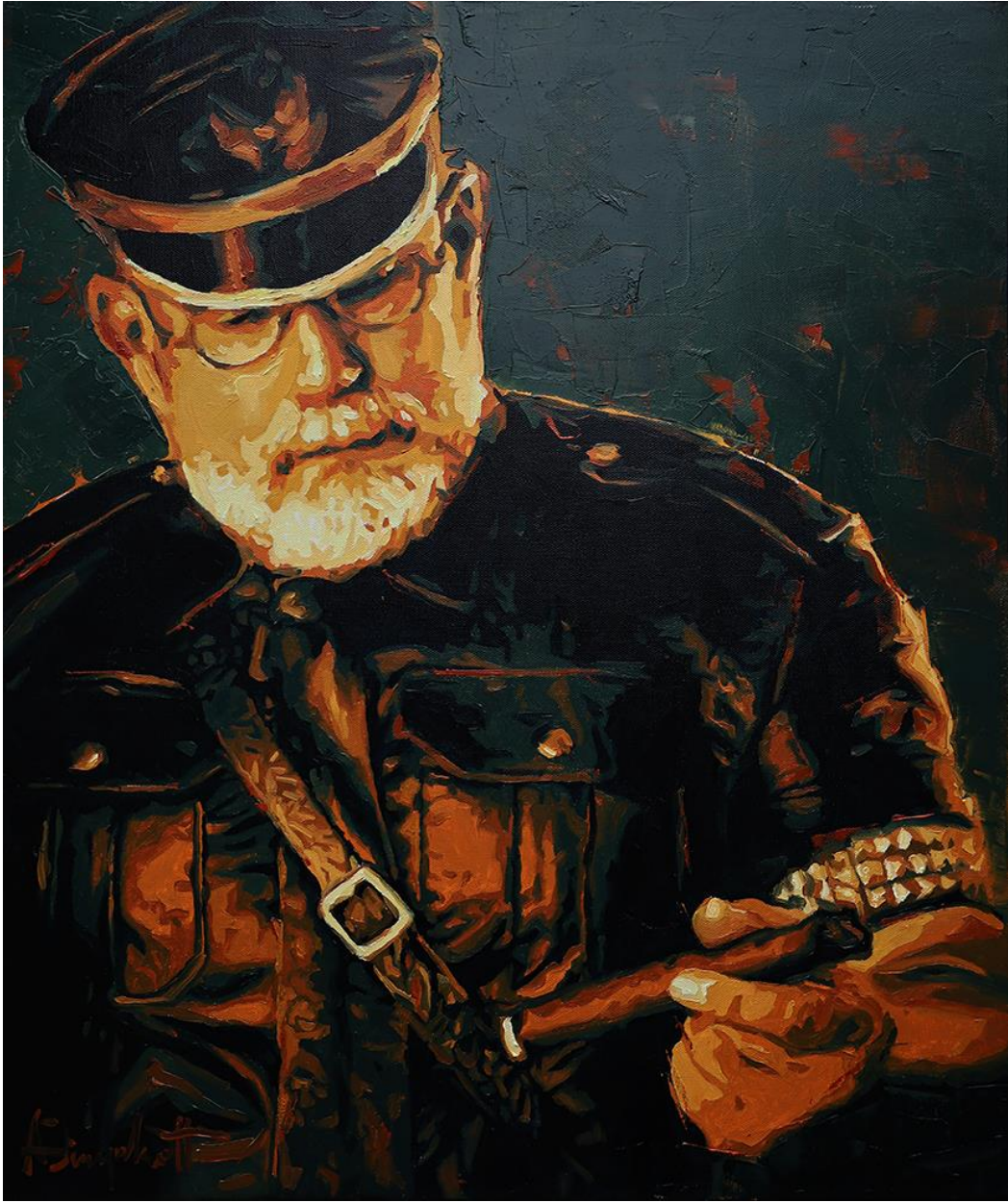
Master Doc oil on canvas 24x20 in $720