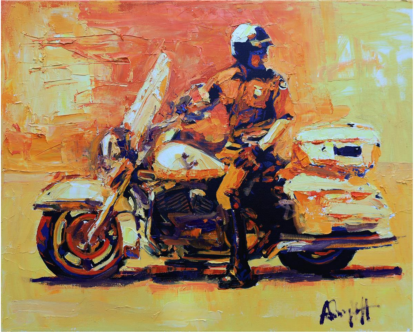
Motor Cop #5 oil on canvas 16x20 in $400