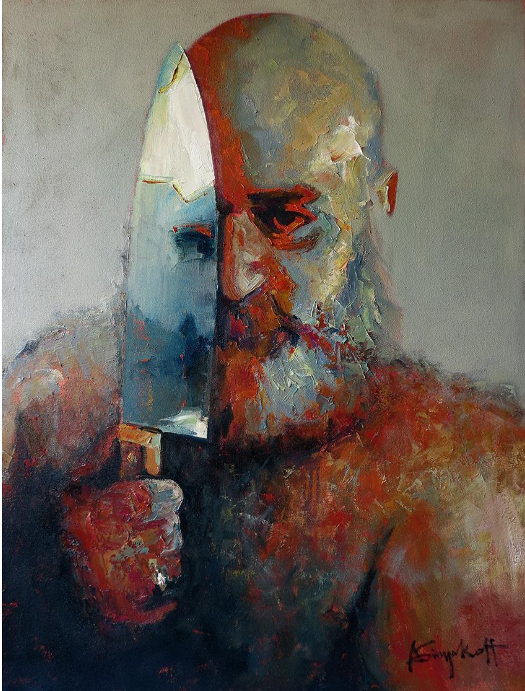
Dear Clarice... oil on canvas 48x36 in $1800