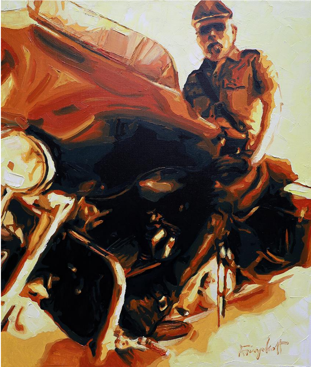
Arizona Heat oil on canvas 24x20 in $720