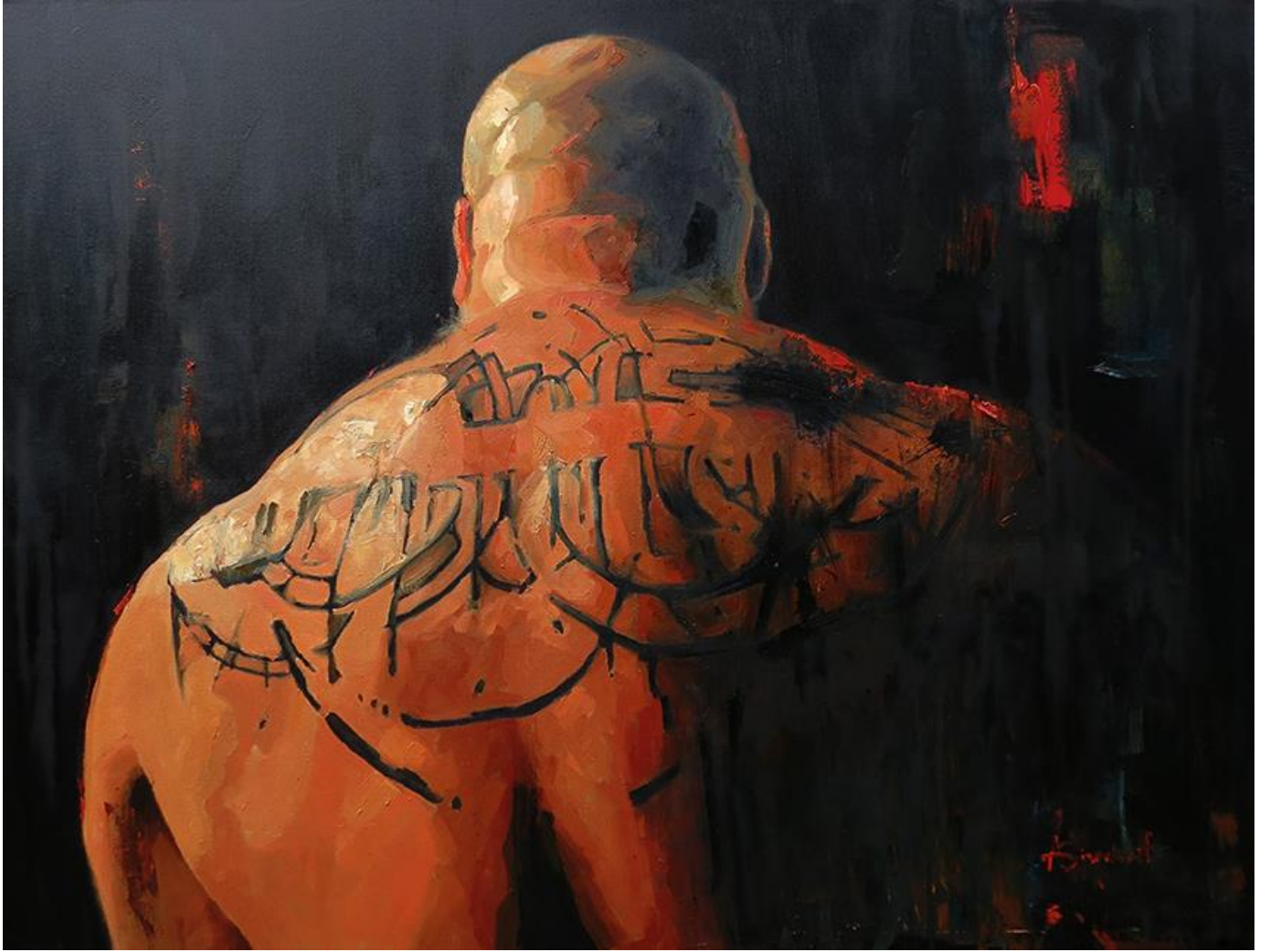
We Don't Need The Key, We'll Break It oil on canvas 36x48 in $2500