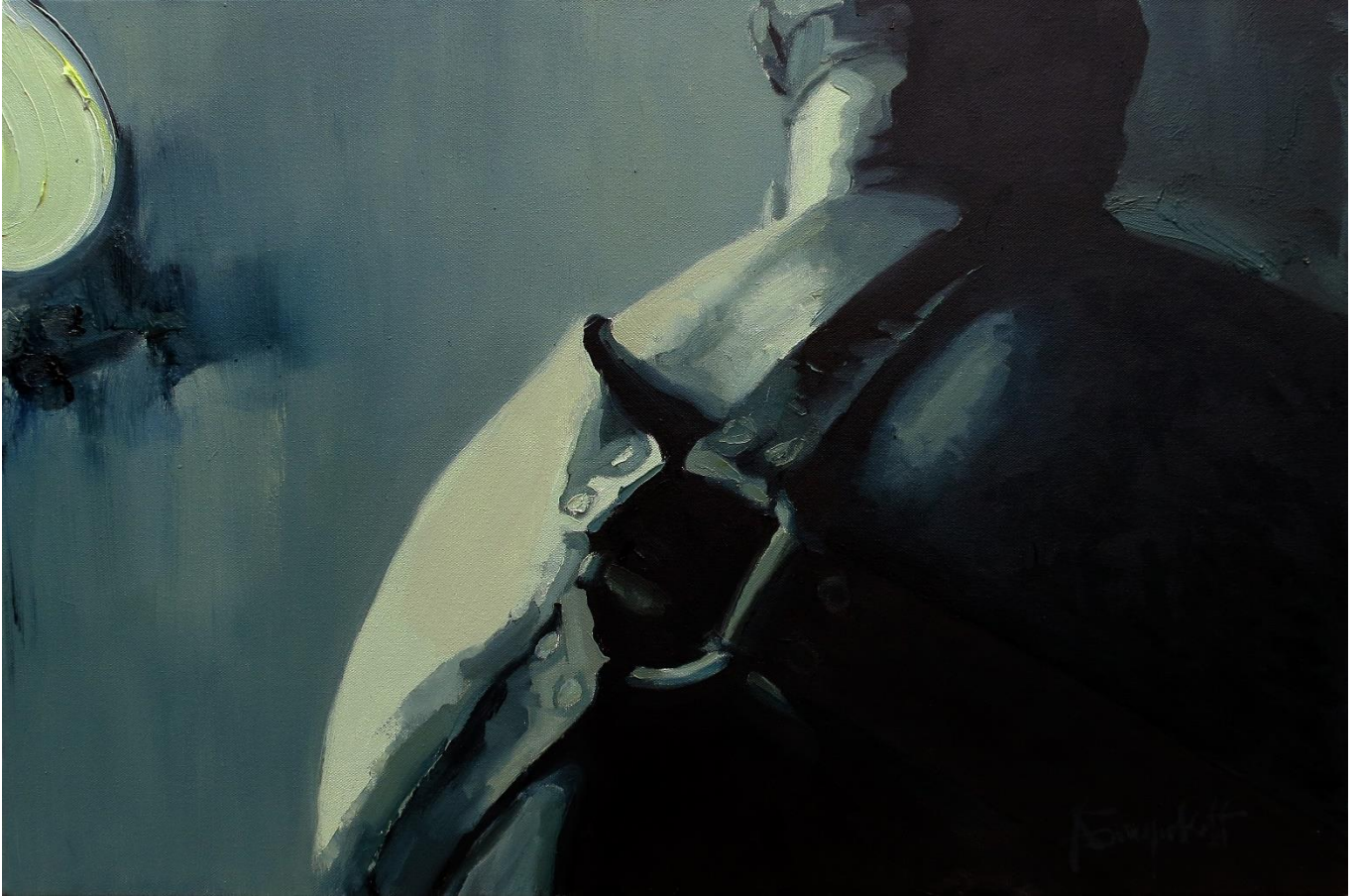
Please Come Back oil on canvas 30x20 in $700