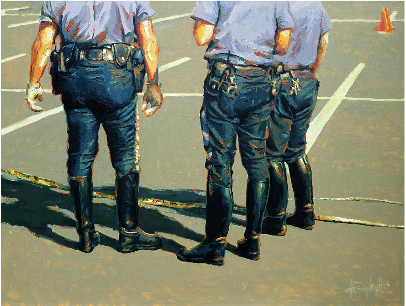
Motor Cops oil on canvas 30x40 in $1800